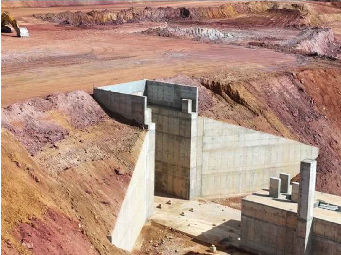
Figure 6: Primary crusher ROM pad and chamber (7 June 2025)

Construction at Kiniero continues to track well against the schedule, with the majority of concrete for the process plant completed. Three shipments of structural steel arrived on site, with progressive deliveries scheduled to arrive every two weeks. The SMP contractor has commenced structural steel erection of the milling building and pipe racks. The milling installation crew has commenced mobilisation to site with erection to begin mid-June 2025. The tailings dam construction is progressing well, with 78% of the phase 1A lining completed.