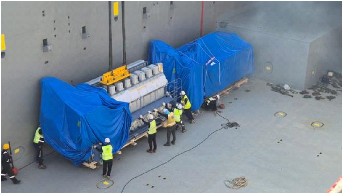
Figure 9: Power station engines collected and loaded into charter vessel (7 June 2025)