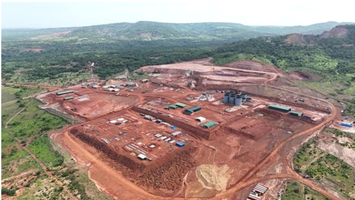
Figure 1: Aerial view of the Kiniero site showing process plant and infrastructure (9 June 2025)

QUEBEC CITY, June 13, 2025 -- West African gold producer and developer Robex Resources Inc (" Robex " or the " Company ") (ASX: RXR | TSX-V: RBX | OTC: RSRBF | Börse Frankfurt: RB4) is pleased to provide a June 2025 project construction update for its Kiniero Gold Project in Guinea, West Africa. Robex is on track to deliver first gold at Kiniero in Q4 2025.