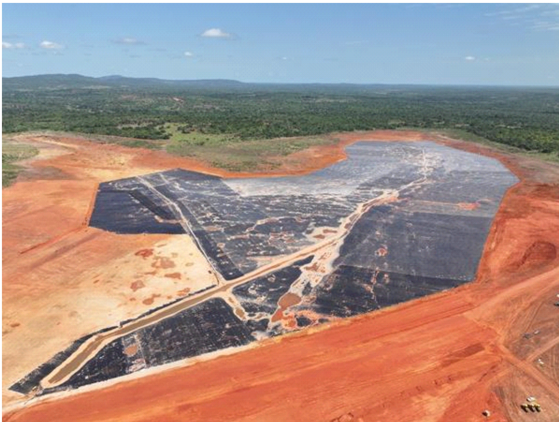
Figure 4: Tailings storage facility showing the extent of lining and main embankment construction (7 June 2025)