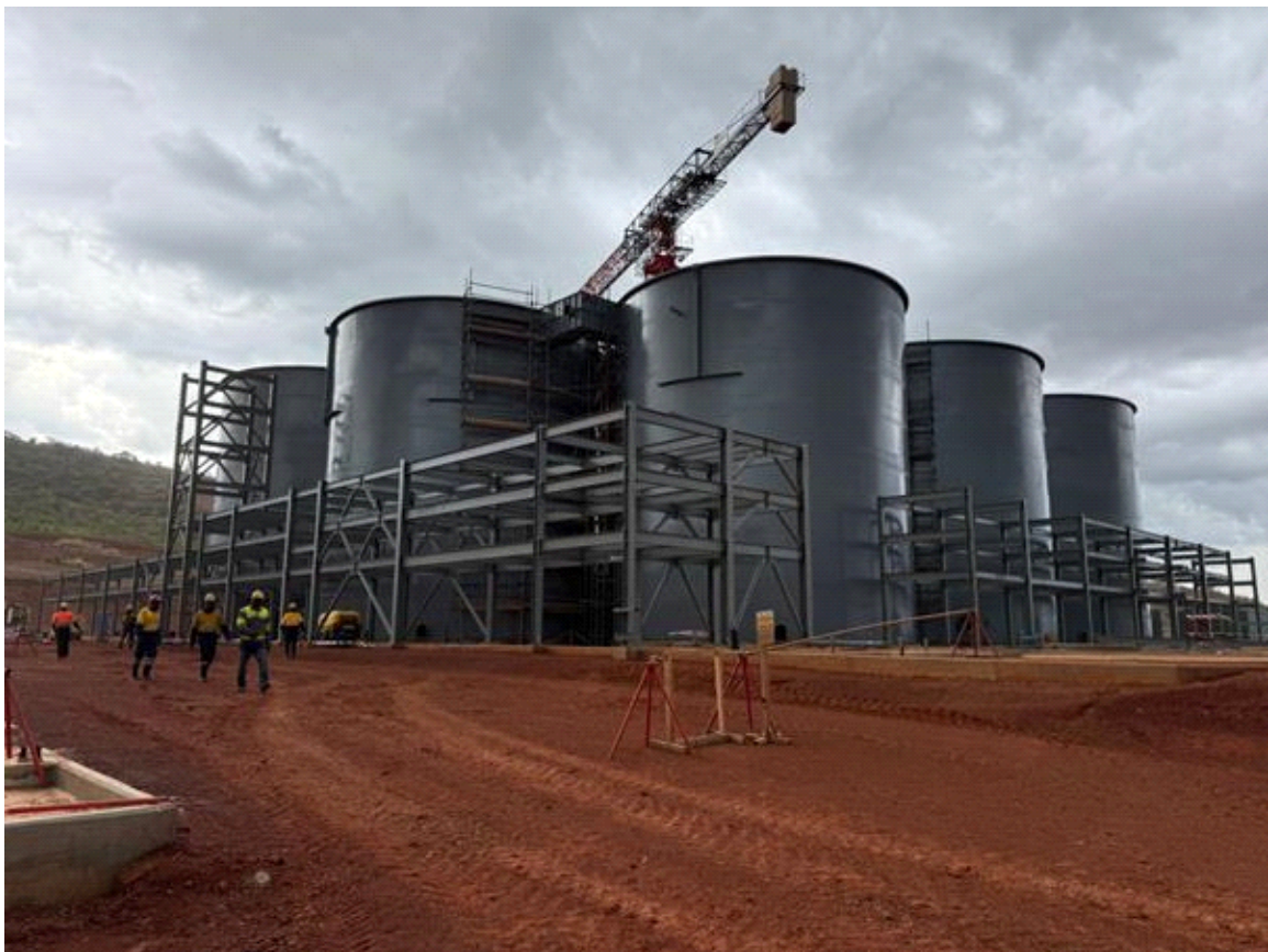
Figure 3: View of CIL with main pipe rack steel erection of steel (11 June 2025)