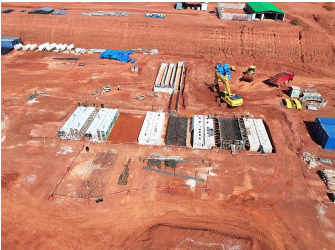
Figure 8: Five out of eight power station generator bases have been poured (7 Jun 2025)