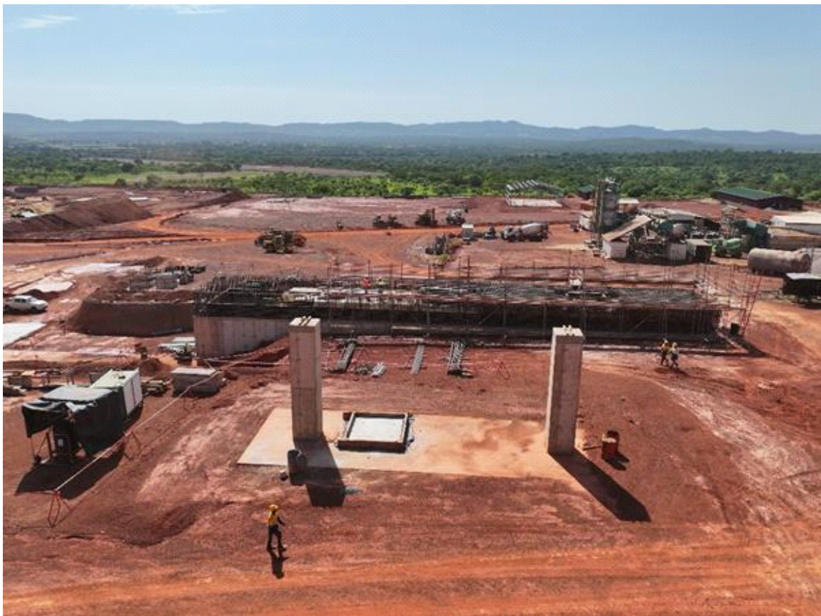
Figure 7: View of reclaim chamber (7 June 2025)