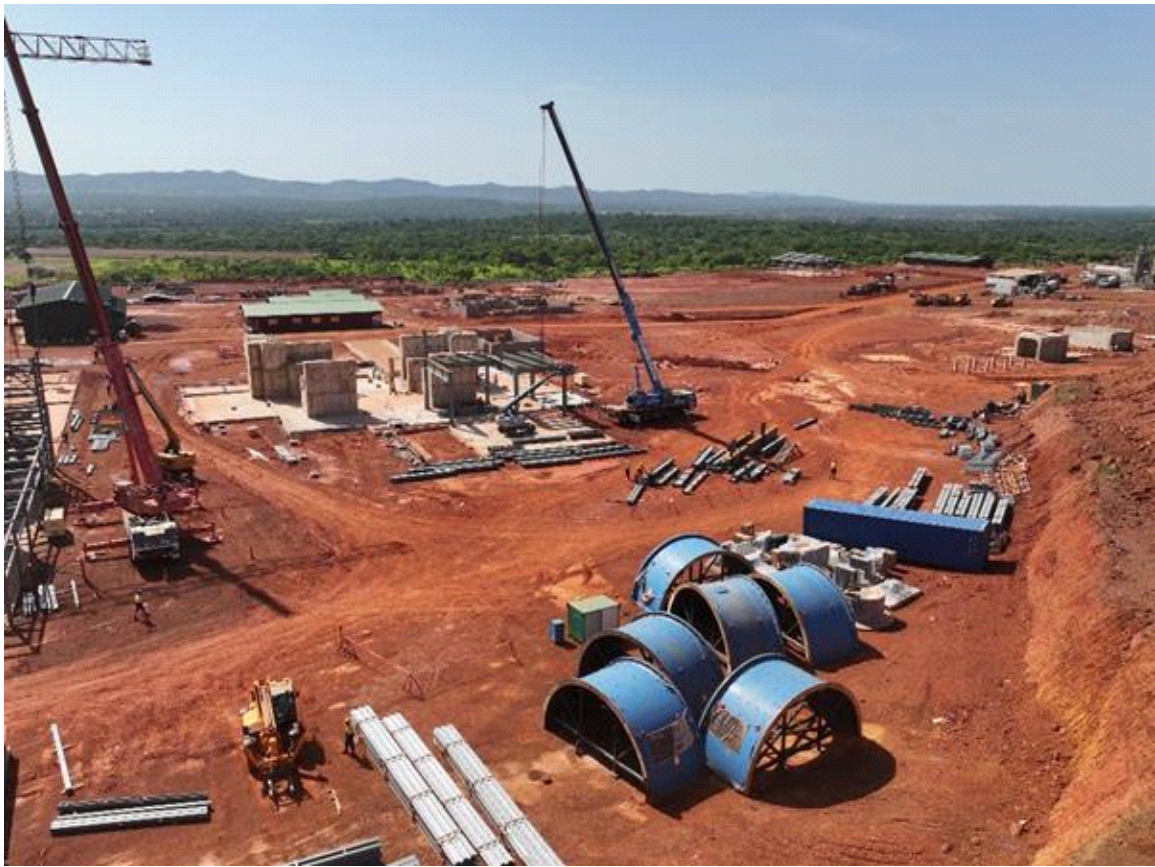
Figure 2: View of Milling building showing erection of steel (7 June 2025)